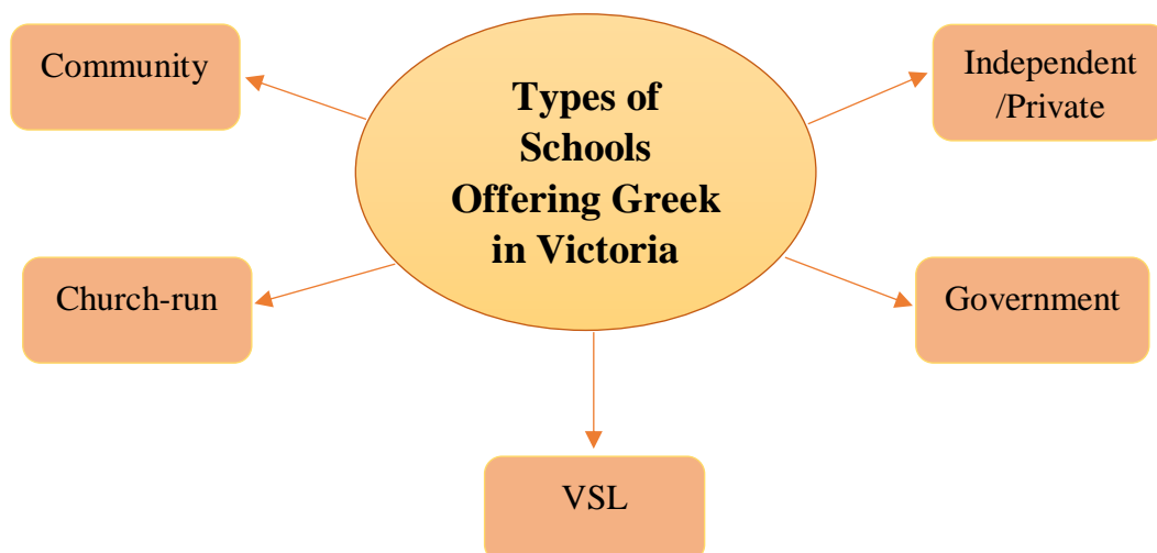
Figure 1: Types of Schools Offering Greek in Victoria

Government schools and the Victorian School of Languages (VSL), including distance education in the VSL. In 2020 Greek language was provided as part of the Designated Bilingual Program in Lalor North Primary School. In schools that offer bilingual education the curriculum is taught for between a minimum of 30 per cent and 50 per cent in the target language. Students have the opportunity to learn through both English and the target language. Greek is currently provided in seven primary schools including Lalor North Primary School and in five secondary schools in Victoria. In addition, there are few non-government schools that include Greek in their curriculum. The Victorian School of Languages provides Greek by distance education to home-schooled secondary students and to secondary students whose mainstream school does not offer the language they want to study. In total, in 2020 there were 56 enrolments in Greek by distance education in VSL (State of Victoria, DET, 2021, pp. 11, 65-66).